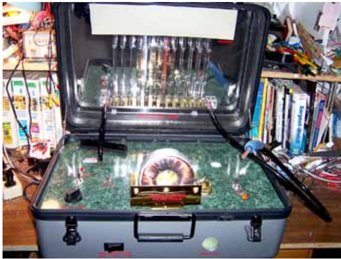
PREMIER 3000 with toroid in front.